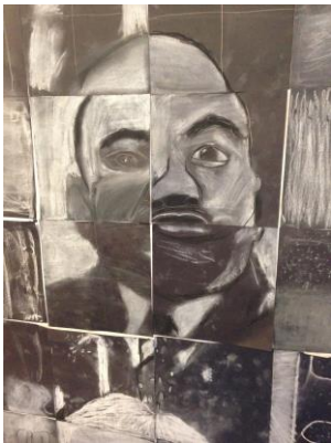
STEM 5 th Grade Artwork 2014